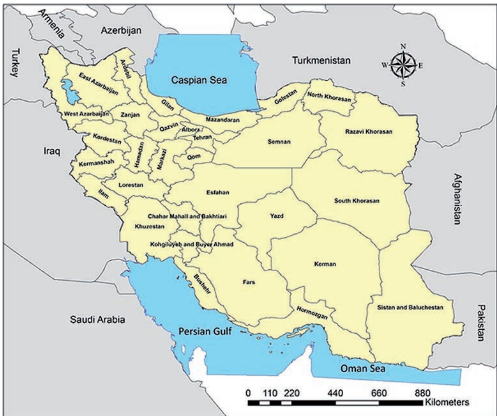
Figure 1. Map of Iran and its 31 provinces.

distributional records in the region or possible new data in Iran. Maes et al. (2018) was consulted for the latest classification of arboviruses of the order Bunyvirales. The capital letter abbreviations used for the names of viruses are based on the “International catalog of arboviruses including certain other viruses of vertebrates” (available at https://wwwn.cdc.gov/arbocat/VirusBrowser.aspx ). There is one exception: all sandfly-borne phleboviruses were mentioned in one keyword “Sandfly fever”. Those are abbreviated SFN-SV because the most common viruses among them are Naples (SFNV) and Sicilian (SFSV) viruses, and also to distinguish them from Semliki Forest virus (SFV). Also, sheep pox virus (SPV) and goat pox virus (GPV) were mentioned in one search result. Though they are different viruses, their clinical diseases are similar. The abbreviations of mosquito and sandfly genera and subgenera follow Reinert (2009) and Galati et al. (2017), respectively. For the valid species names of different arthropod taxa, the following references and webpages were consulted: biting midges (Borkent, Dominiak, 2020), horseflies (Moucha, 1976), mosquitoes (Azari-Hamidian et al., 2019, 2020; Harbach, 2023), sandflies (Secombe et al., 1993) and ticks (Gugliemone et al., 2010, 2014; Hosseini-Chegeni et al., 2019).